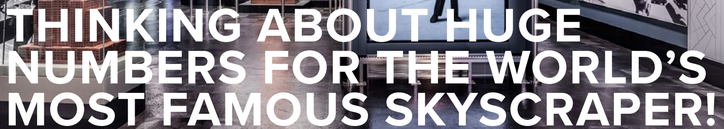
Exhibit Connections: Model Replica, Construction, Observation Deck